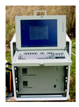
Outdoor unit: pc and electronic