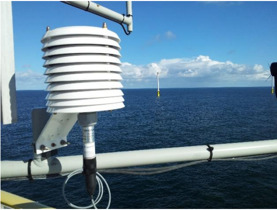
OMC-422 with OMC-406 probe mounted on a pole