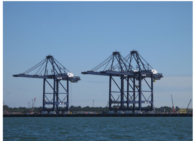
Wind system on crane