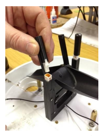
Figure 6 - SBS replaceable reed switch (left) / Empty socket to house one of the reed switches (centre) / reed switch being inserted into the empty socket.

<u>PLEASE NOTE:</u> A spares kit is available with filter, cap, and screws. Contact EML sales (sales@emltd.net) for more information.