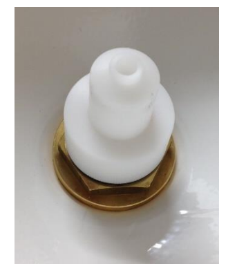
Figure 4 - Filter and filter cap (left) / Nozzle delivering water into tipping bucket (right)

The internal tipping bucket assembly rotates around precisions rolling pivot bearings. The balance arm tips when the first bucket is full, emptying this rain water and positioning the second bucket under the funnel. The tipping process repeats indefinitely as long as the rain continues to fall, with each tip corresponding to a calibrated fixed quantity of rainfall. At each tip of the bucket the moving arm forces the magnet past the reed switch causing contact to be made for a few milliseconds. As each bucket side is used in turn, the outgoing water is drained away via outlets and discarded Figure 5.