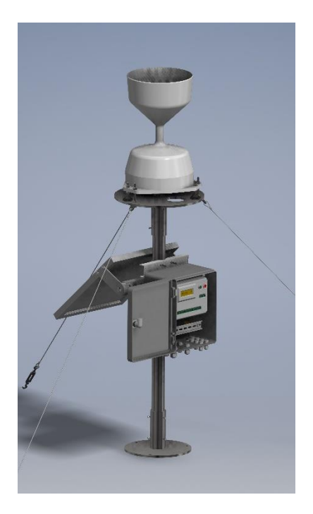
Figure 2 - SBS500 fitted to a pedestal as part of the EML system