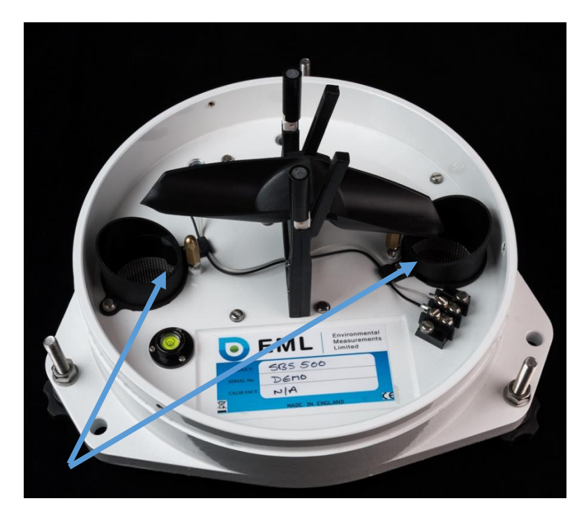
Figure 5 - Internal photograph highlighting water drains

The exact calibration of each tip is pre-set by adjustable stops. Do not alter these stops unless as part of a calibration exercise. A levelling bubble is provided as an aid to levelling of the rain gauge. Connections to the reed switches are made via the connector terminals.