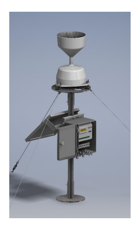
Figure 3 – Rain gauge fitted to a pedestal as part of the EML system