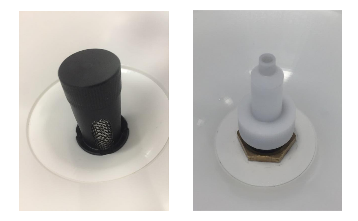
Figure 5 - Filter and filter cap (left) / Nozzle delivering water into tipping bucket (right)

Rainfall is measured by the well-proven tipping bucket method. Precipitation is collected by the funnel and flows through a stainless-steel gauze filter, trapping and removing any leaves, dirt, etc. Figure 5. Water then drips from the nozzle into one of the two halves of the tipping bucket.