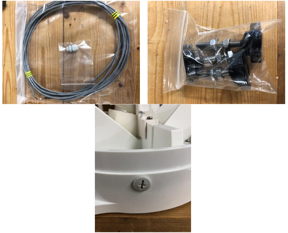
Figure 1 - Cable gland and cable (top left), levelling feet (top right) and blanking plug (bottom)