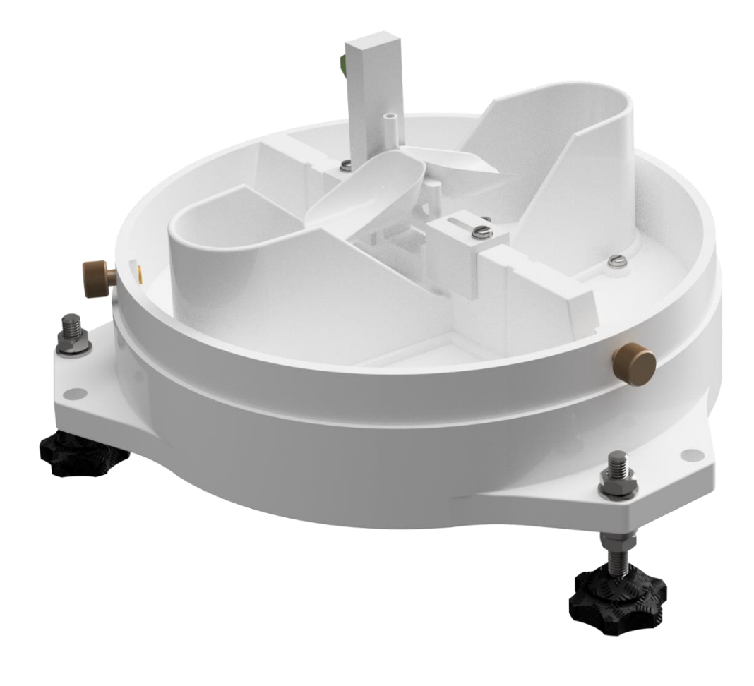
Figure 6 - Internal image of the ARG314 tipping bucket mechanism

The exact calibration of each tip is pre-set by adjustable stops located under the tipping buckets. Do not alter these stops unless as part of a calibration exercise. A levelling bubble is provided as an aid to levelling of the rain gauge. Connections to the reed switches are made via the green connector terminal.