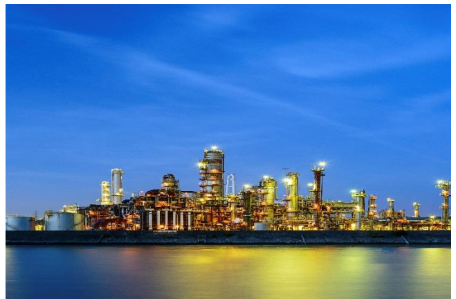
Applications Offshore and Industry