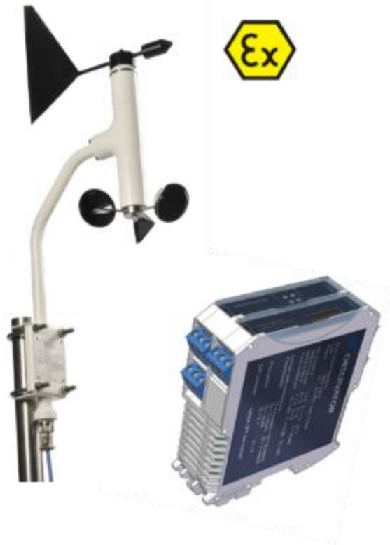
OMC-150 Anemometer with OMC-158-2 Interface